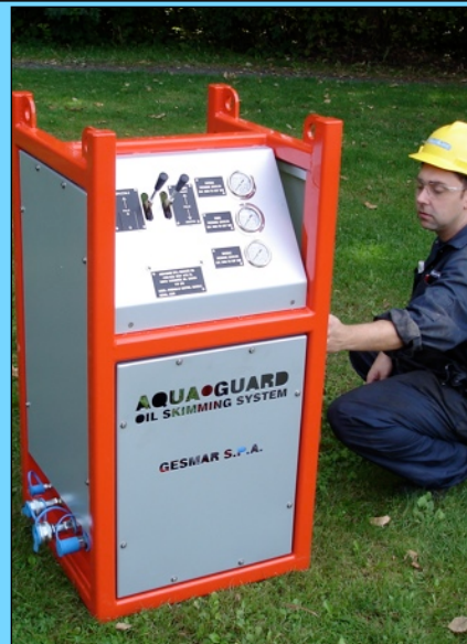
The Aqua-Guard Team with Italian consortium personnel