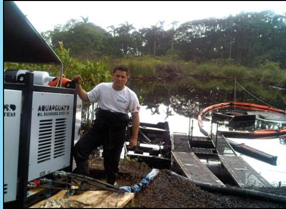
Aqua-Guard responds to multiple oil spills with equipment and service from northern Canada to the jungles of Central and South America.