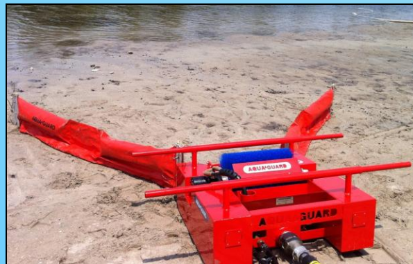
Aqua-Guard took part in several oil spill response training sessions in the U.S.A. and Latin America over the past several months. Aqua-Guard continues to work closely with its partners and customers.